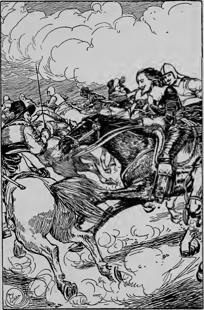
The Flight of Charles at Naseby May Gibbs